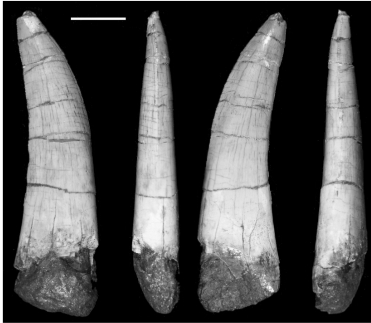
Fig. 1 Tooth XMDFEC V0010 seen in (left to right) labial, anterior, lingual and posterior views Scale bar = 10 mm

The tooth is long, tapers evenly to the tip and is very slightly D-shaped in cross-section being somewhat more flat on the lingual face and bowed on the labial face (though this is overall much closer to a circular cross-section than a more normal laterally compressed theropod tooth as is common for spinosaurids). The tooth exhibits a gentle posterior recurvature along its length. In anterior and posterior view, it shows a slight sinusoidal curve labio-lingually (see Fig. 1), a feature that does not appear to be the result of breakage or distortion.