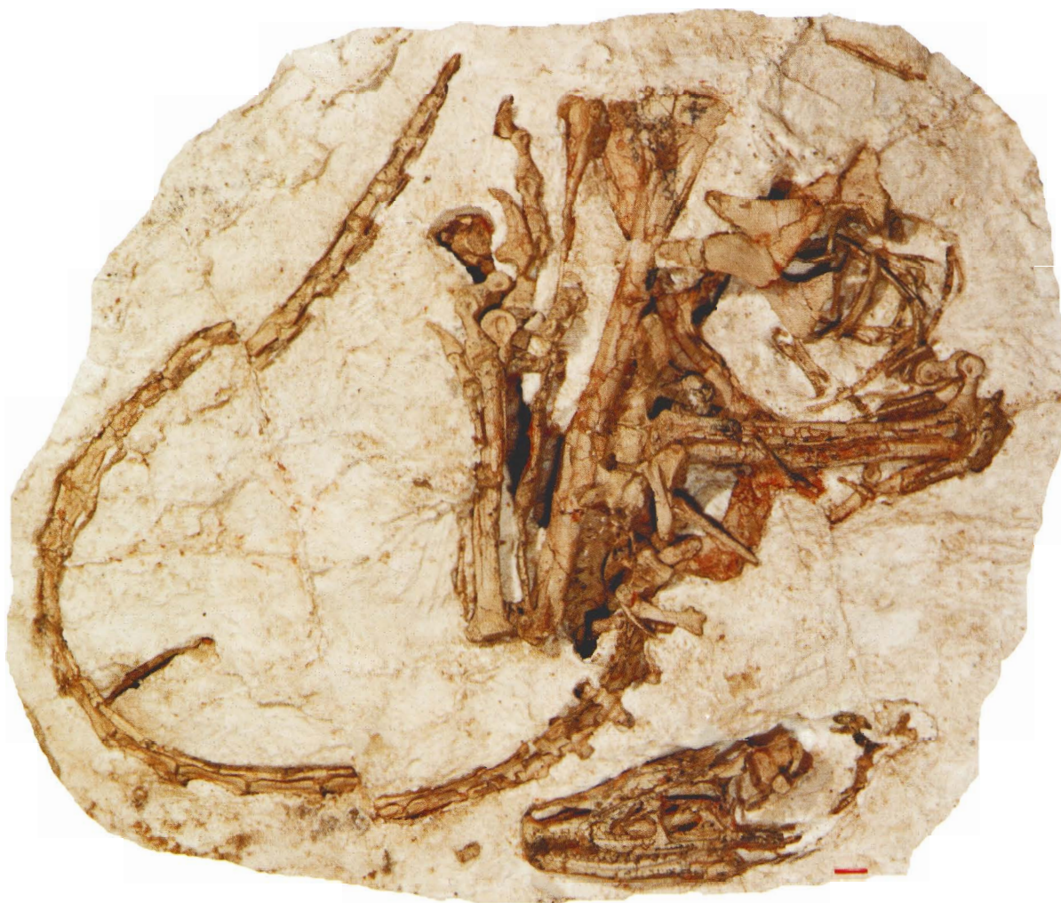
Fig. 1. Photograph of the holotype of Sinusonasus magnodens gen. et sp. nov. (IVPP VI1527). Scale bar equals 1 cm.

ventral border of the external naris; close examination reveals, however, that a slender subnarial process of the premaxilla contacts the nasal below the external naris. The antorbital fossa, with a relatively rounded ventral rim, contains a relatively small antorbital fenestra, a large maxillary fenestra and a slit-like promaxillary fenestra. In S. changii , the promaxillary fenestra is represented by a distinctive opening (Xu et al., 2002c). The nasal is depressed above the external naris as in some velociraptorines (Barsbold and Osmólska, 1999; Xu, 2002) and is again depressed above the maxillary fenestra, thus making a sinusoid outline in lateral view. As in S. changii (Xu et al., 2002c), the lateral edge of the nasal forms a small shelf adjacent to the nasomaxillary suture. The lacrimal is T-shaped in lateral view, with a relatively long rostral process and a pronounced lateral projection that overhangs the descending process. A pneumatic fossa, present in other