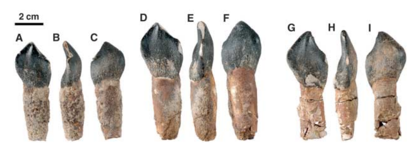
Fig. 2. Teeth of T. riodevensis (specimens CPT-1213, CPT-1215, and CPT-1217, from left to right). Lingual [(A), (D), and (G)], distal [(B), (E), and (H)], and labial [(C), (F), and (I)] views are shown.

long. The proximal end of the tibia is compressed mediolaterally, representing a primitive state recorded in basal sauropods (11, 12). The astragalus is wedge-shaped in cranial view,