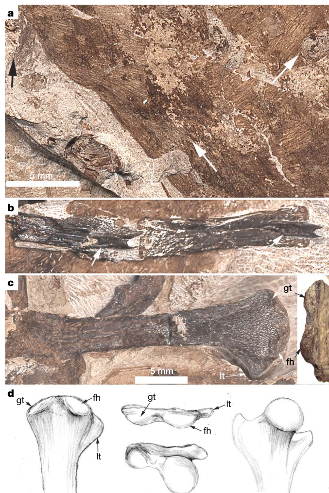
Figure 3 | Detailed features related to gliding and arboreal locomotion of Volaticotherium antiquus . a , Close-up view of the patagium impression of V. antiquus (IVPP V14739), with white arrows indicating nearly perpendicular orientations of hair on two layers of impressions. b , Ventral views of two long, flat, caudal vertebrae with white arrows pointing to two long, flat, haemal arches. c , Dorsal (anterior) and proximal views of the right femur, showing the small, ovoid-shaped head that lacks a neck. d , Comparison of the femoral head of V. antiquus (labelled) with that of a morganucodontid (modified from ref. 25). fh, femoral head; gt, greater trochanter; lt, lesser trochanter.