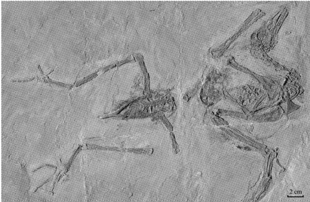
Fig. 1. Yanornis martini gen. et sp. nov., holotype (V12558).

Diagnosis. Dentary straight, about 2/3 the length of skull, with about 20 teeth. Cervicals long, heterocoelous. Synsacrum composed of 9 sacrals. Pygostyle short and less than 1/3 the length of tarsometatarsus. Sternum with a pair of posterior fenestra; distal end of the lateral process semicircular. Ratio of forelimb to hindlimb length about 1.1. Manus shorter than ulna and radius. Tarsometatarsus completely fused. Ratio of third pedal digit to tarsometatarsus length 1.1. Proximal pedal phalanges longer and more robust than distal ones.