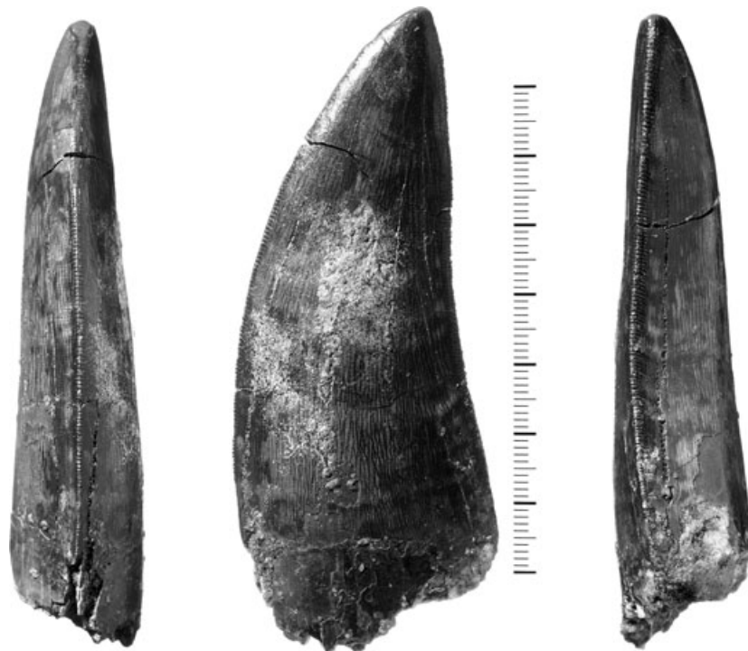
Fig. 2. Theropod lateral tooth, Carcharodontosaurus sp., mid-Cretaceous, Kem Kem, Morocco; BSPG 1993 IX 1, in mesial (left), (?) lingual (middle) and distal (right) views. Note the slight sinusoidal curve of the tooth in distal view. Note the small wear facet at the tip, especially visible in mesial view. Scale bar with 10- and 1-mm divisions.

While some theropod teeth were dislodged by biting bone (e.g. Hypacrosaurus fibula with embedded tooth, see Fig. 3), this may represent the loss of loose or old teeth in which the root was already partially or fully resorbed (wear on theropod teeth is actually not uncommon but has mainly been described for tyrannosaurs; see Farlow & Brinkman 1994; Schubert &