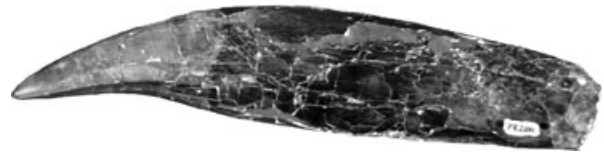
Fig. 4. A complete theropod tooth ( Tyrannosaurus rex ) showing the crown and large root. Total length of the tooth is 300 mm, of which approximately 100 mm is crown and 200 mm is root. The relative proportions are typical of theropod teeth.

It must be considered a strong probability that although living biomass of dinosaurs was biased towards large adults, juvenile animals may have been systematically the primary prey of choice for the