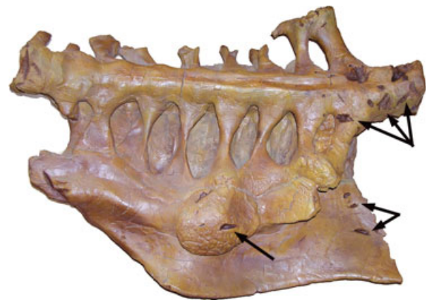
Fig. 1. Triceratops sacrum with bite marks (black arrows) attributed to Tyrannosaurus . The lower right section has actually been bitten off. Moulds taken from the scores and punctures replicate the teeth of Tyrannosaurus (Erickson & Olson 1996).

Studies on the occurrence of predator-damaged bones within accumulations, such as species-specific