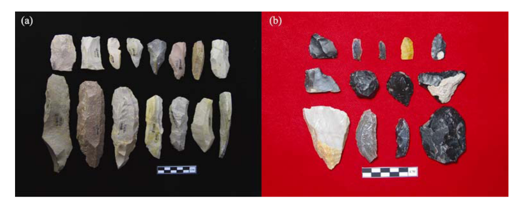
Figure 1 Stone artifacts excavated from Shuidonggou Locality 1 (a) and Locality 2 (b).