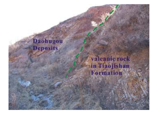
Figure 3. Field photo showing the direct contact between the lowermost Daohugou deposits and the underlying ignimbrites at the Jiangzhangzi locality (N 41^{\circ} 24' 26.8'' ; E 119^{\circ} 15' 31.6'' ), indicates that the Daohugou bed is younger than the ignimbrite.

[6] Finally, Liu and Liu [2005] have shown in their Figure 3 four field photos to indicate the Daohugou deposits underlying the Yixian Formation, which support one of our conclusion that the Daohugou bed is older than Yixian Formation. However, These photos are completely irrelevant to the topics discussed in their comment. With all the arguments in their comment, we are puzzled why they cannot just provide a single field photo showing the direct contact between the Daohugou deposits and the ignimbrites, the age of the latter is now generally concurred by all of us.