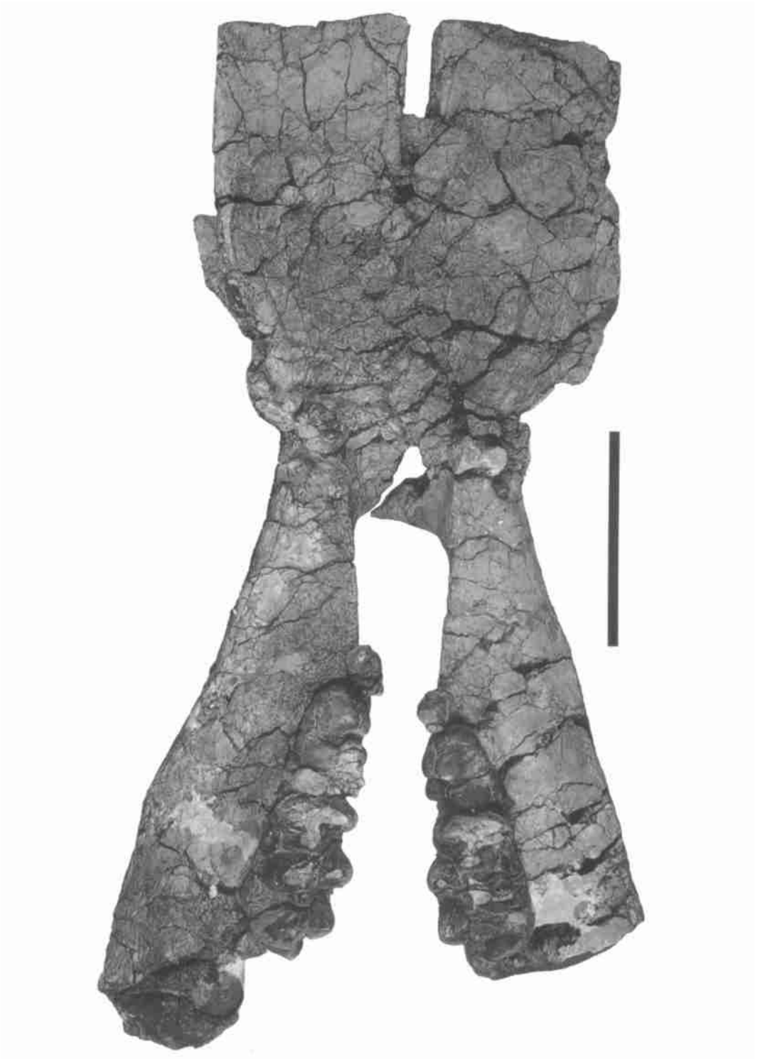
图 1 党河铲齿象(新种)下颌骨冠面(V 13322,正型标本),标尺:10cm